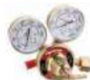
Acetylene Regulator SR027-AC