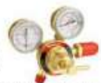
Acetylene Regulator SR250-AC