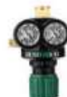
Oxygen Regulator ESS3-150-540