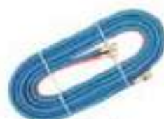
Twin Rubber Hose 20Ft W/Fitting 5/8UNF T Grade