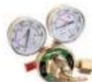
Oxygen Regulator SR027-OX