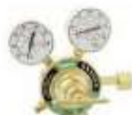
Oxygen Regulator SR450-540