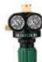
Oxygen Regulator ESS4-150-540