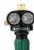
Oxygen Regulator ESS3-150-540