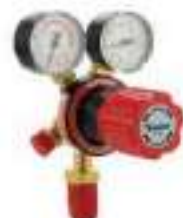
Acetylene Regulator SR159-AC