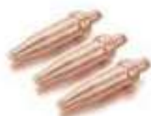
Type 41 Cutting tip (#8,12,15)