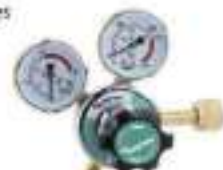
Oxygen Regulator SR025-OX