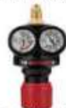
Acetylene Regulator ESS4-15-510