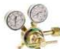
Oxygen Regulator SR250-OX