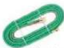
Twin Rubber Hose 20Ft W/Fitting 9/16" R Grade