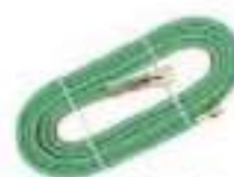
Twin Rubber Hose 15ft W/Fitting 9/16" R Grade