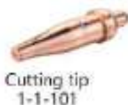
Cutting tip 1-1-101