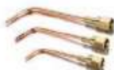
Welding nozzle VH-W(1,3,5)