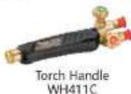
Torch Handle WH411C