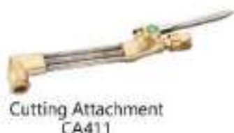
Cutting Attachment CA411