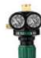
Oxygen Regulator ESS3-150-540