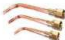
Welding nozzle VH-W(1,3,5)