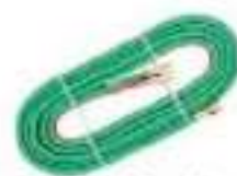
Twin Rubber Hose 20ft W/Fitting 9/16" R Grade