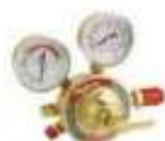
Acetylene Regulator SR450-510