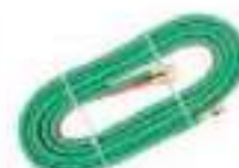
Twin Rubber Hose 15ft W/Fitting 9/16" T Grade