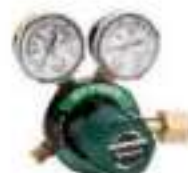
Oxygen Regulator G350-150-540