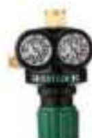
Oxygen Regulator ESS4-150-540