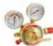
Acetylene Regulator SR450-510