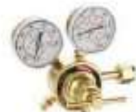
Acetylene Regulator SR350-AC