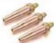
Type 44 Cutting tip (#8,12,15)