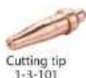
Cutting tip 1-3-101