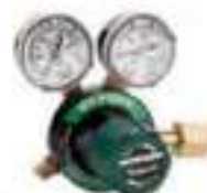
Oxygen Regulator G350-150-540