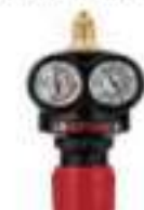
Acetylene Regulator ESS3-15-510