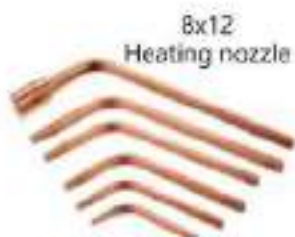
8x12 Heating nozzle