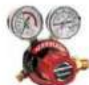
Acetylene Regulator G350-15-510