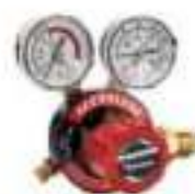
Acetylene Regulator G350-15-510