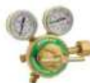
Oxygen Regulator SR300-540