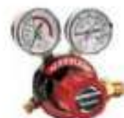
Acetylene Regulator G350-15-510