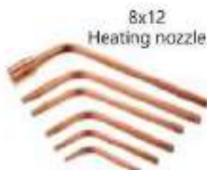
8x12 Heating nozzle