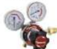
Acetylene Regulator SR025-AC