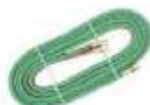
Twin Rubber Hose 15ft W/Fitting 9/16" R Grade