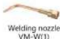
Welding nozzle VM-W(1)