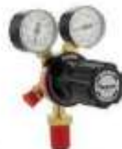
Oxygen Regulator SR159-OX