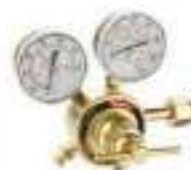
Acetylene Regulator SR350-AC