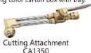
Cutting Attachment CA1350