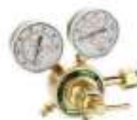
Oxygen Regulator SR350-OX