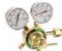
Oxygen Regulator SR350-OX