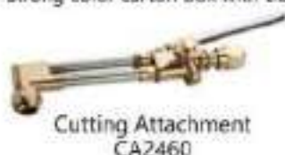
Cutting Attachment CA2460