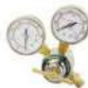
Oxygen Regulator SR140-540