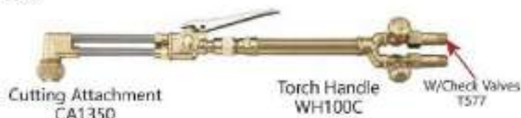
Cutting Attachment CA1350