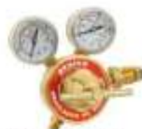
Acetylene Regulator SR300-510