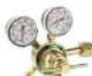
Oxygen Regulator SR250-540