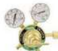
Oxygen Regulator SR450-540