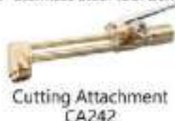
Cutting Attachment CA242