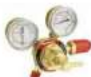
Acetylene Regulator SR250-510

Option: Flashback Arrestor Set For Regulator R288