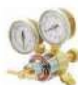
Acetylene Regulator SR140-200