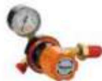
L.P.G Regulator SR159-LP