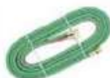
Twin Rubber Hose 15Ft W/Fitting 9/16" R Grade