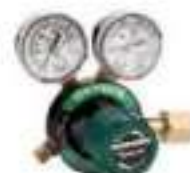
Oxygen Regulator G350-150-540